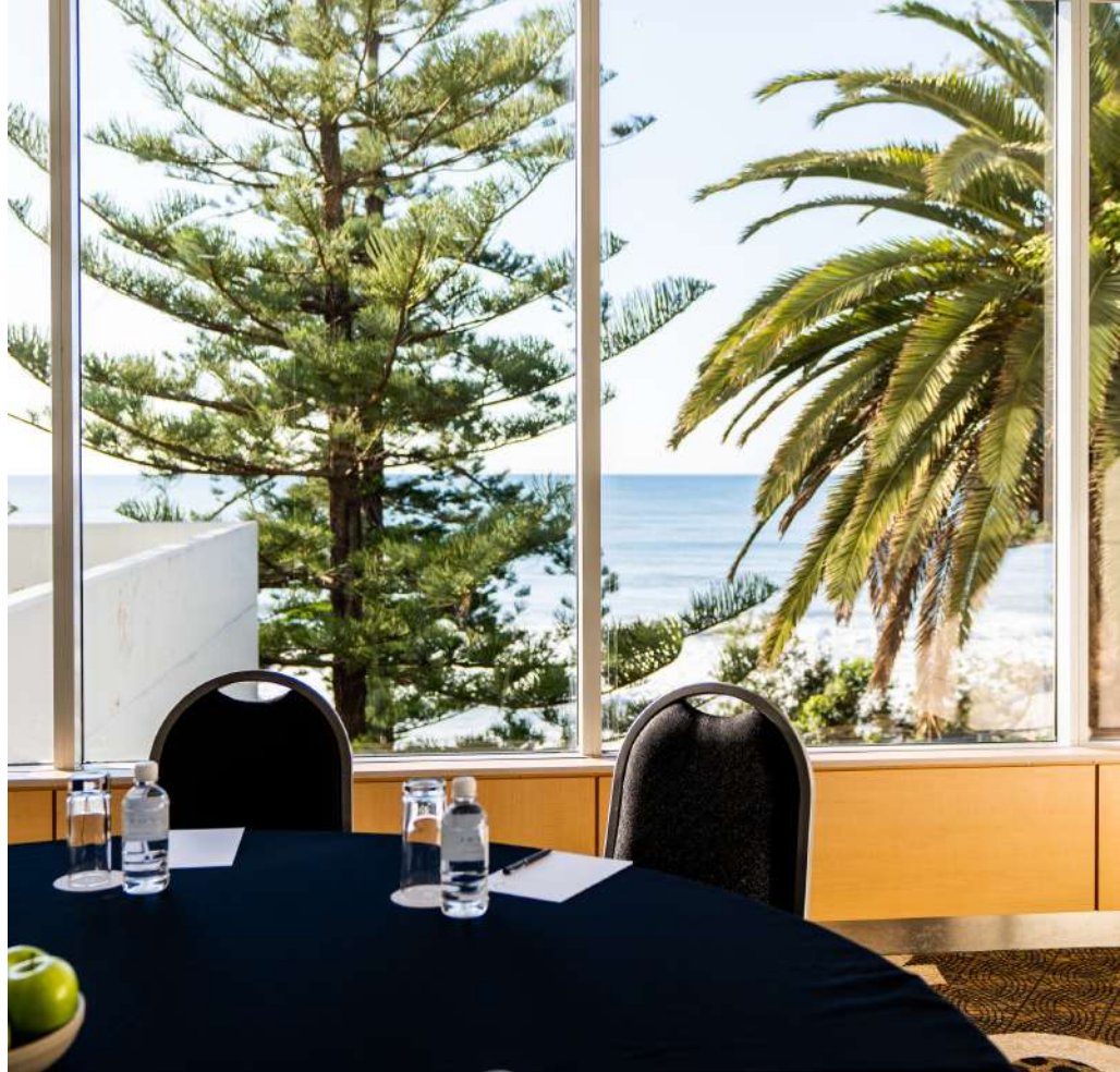
Capacity of meeting rooms in number of guests.