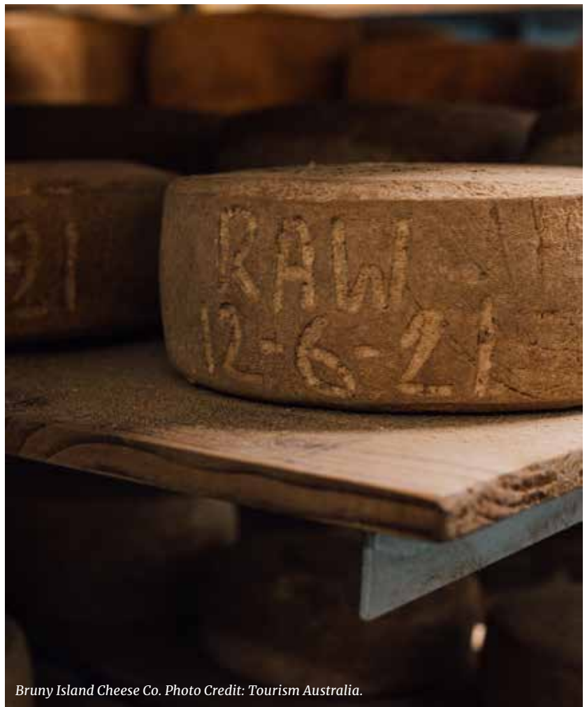
Bruny Island Cheese Co.

In 2017 Nick started Glen Huon Dairy Co, acquiring a now organically certified farm that is home to some (very happy) rare breed cattle, and sole supplier of milk to Bruny Island Cheese Co. As if that were not enough, Bruny Island Beer Co was also established around the same time, making beer that much like their cheese, is an artisanal product that strives to be the best expression of the seasonally variable ingredients available in the region. Or in layman's terms... for cheese makers they make bloody great beer!