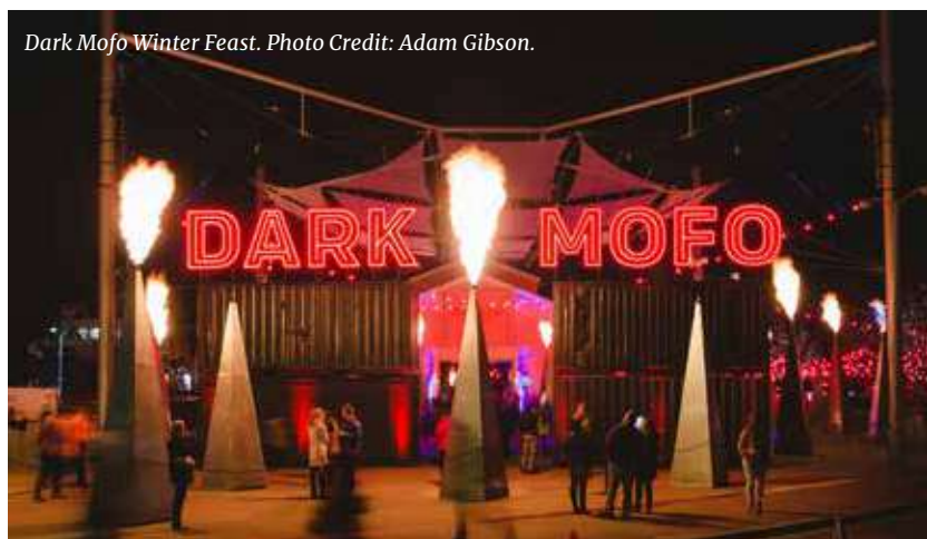
Dark Mofo Winter Feast.

Worn a puffer jacket (a Tassie Tux) to Winter Feast, and experienced Dark MOFO festival. 🐧