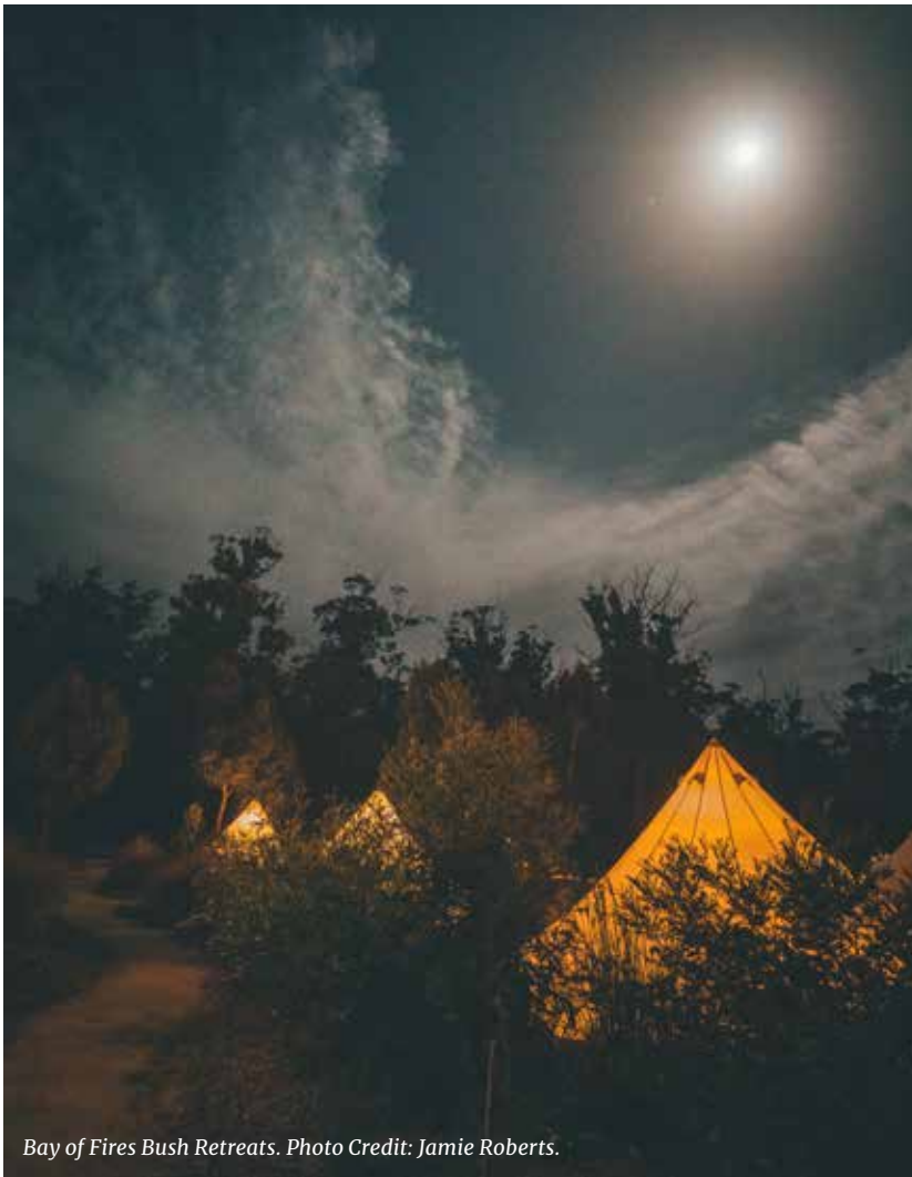
Bay of Fires Bush Retreats.