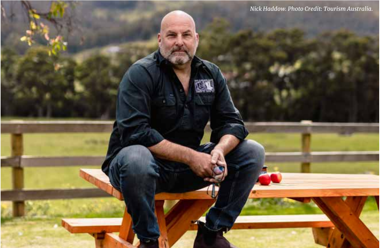
Nick Haddow.