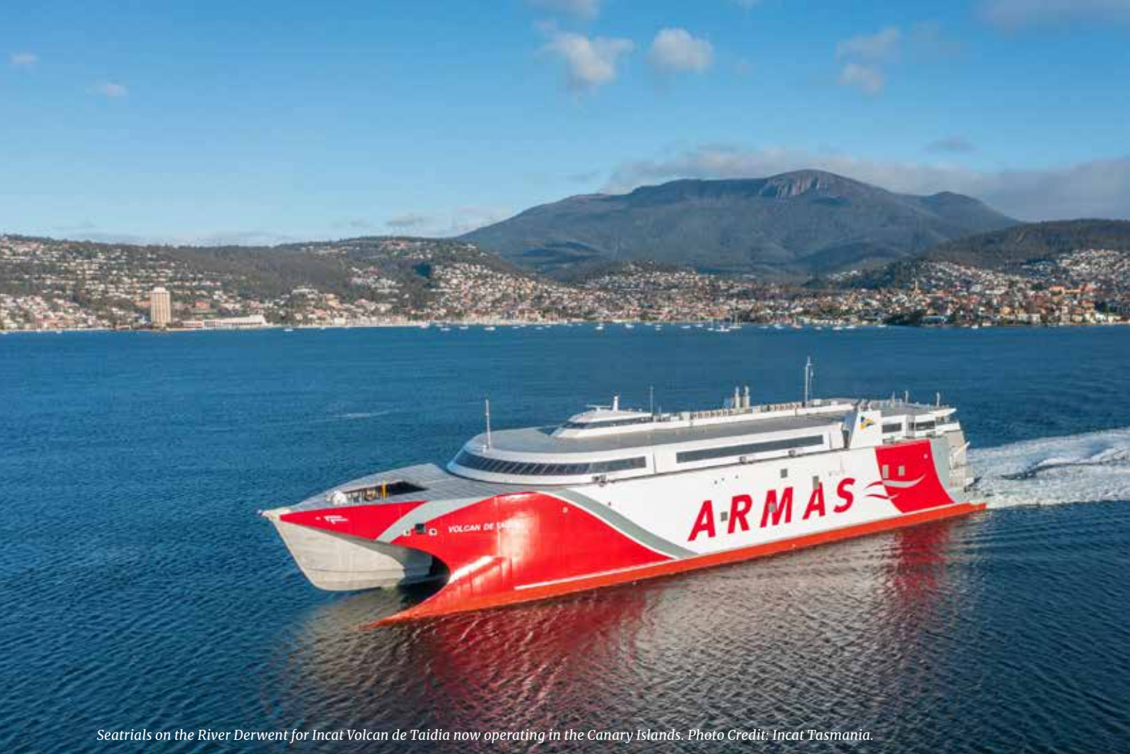
Seatrials on the River Derwent for Incat Volcan de Taidia now operating in the Canary Islands.