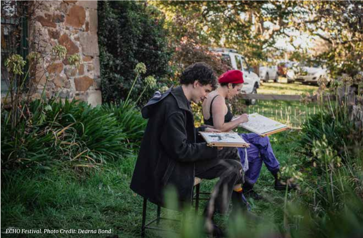
ECHO Festival.

Here the Rest take on The West in an attempt to crack the greatest homeground advantage in the state. Built in 1895, Queenstown's iconic gravel oval is not for the faint of heart, with blood, sweat and tears shed by locals and blow-ins alike across the four quarters of this gruelling AFL match, that is a nod to the west coast's culture of 'west coast tough' where the people either find a way or make a way!