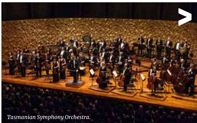
Tasmanian Symphony Orchestra.