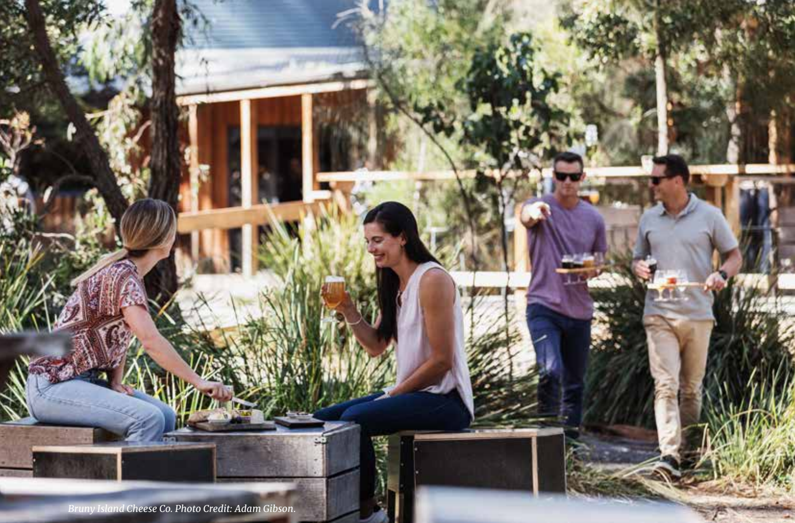
Bruny Island Cheese Co.