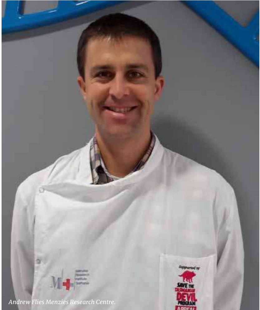
Andrew Flies Menzies Research Centre.

In 2022, Andi's work brought the Third Biennial Australian Industrial Hemp Conference to Launceston. An impressive program of national and international speakers included a post event field day, giving delegates a truly unique opportunity to witness nearly all aspects of hemp production and processing in one day – made possible because unlike big cities, our conferencing facilities in Tasmania are close to farming