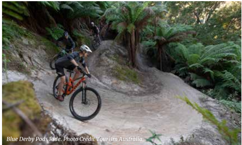
Blue Derby Pods Ride.

After a fair bit of travel in my early 20s I simply can't imagine living anywhere else. I love to travel and work for fun, and I've