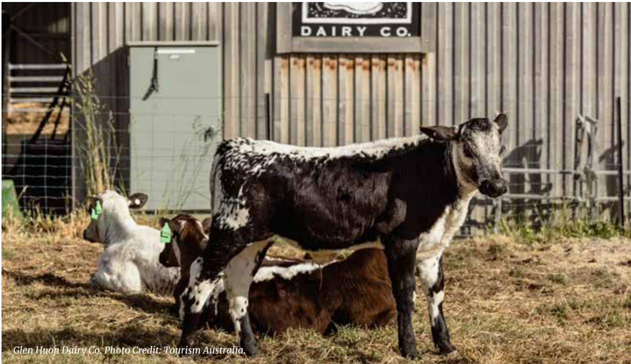
Glen Huon Dairy Co.