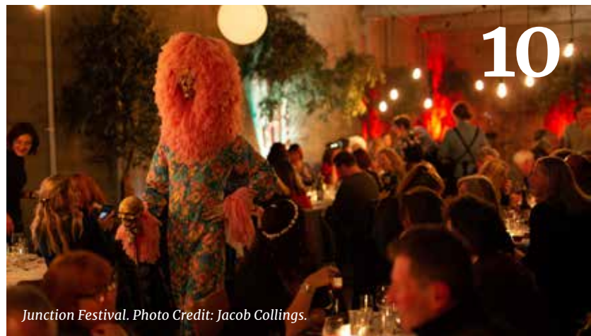
Junction Festival.