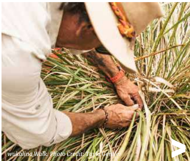
wukalina Walk.

T asmania is celebrating a swag of medals at the 2022 Qantas Australian Tourism Awards. Amongst the medallists are Business Events Tasmania members Bangor Vineyard Shed taking gold (Tourism Wineries, Distilleries & Breweries), and bronze went to Peppers Silo Hotel (Business Events Venues) and Mures Tasmania (Tourism Restaurants & Catering Services).