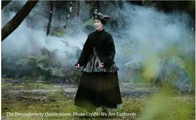
The Unconformity Queenstown.

With so many Tasmanians invested in our island's rich cultural landscape, it is little