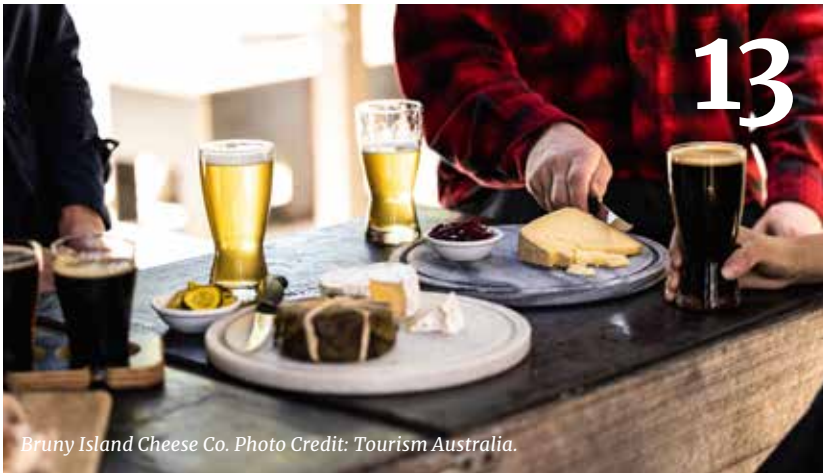
Bruny Island Cheese Co.