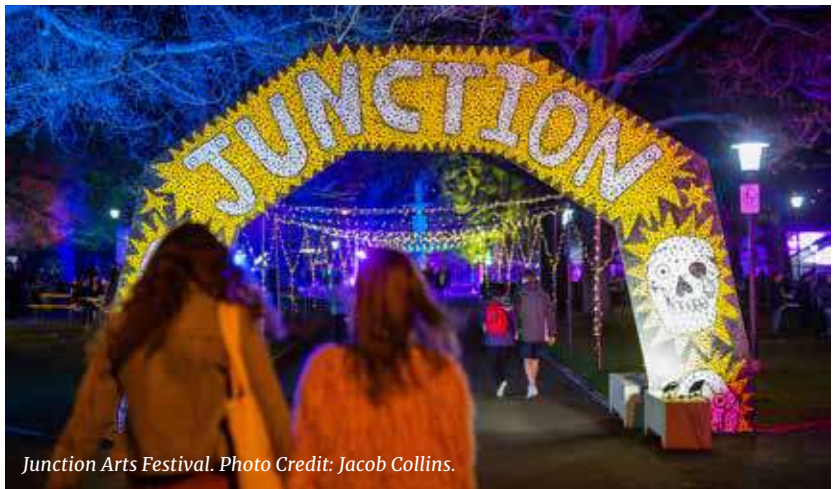
Junction Arts Festival.