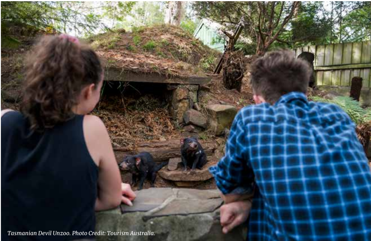
Tasmanian Devil Unzoo.

Visionaries come from a range of sectors and with a wealth of knowledge and experience, and each has a unique story to share.