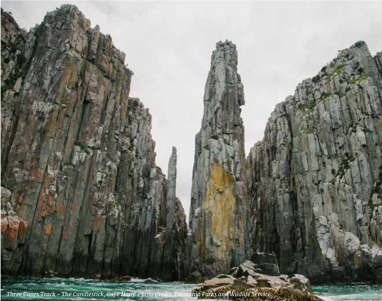
Three Capes Track - The Candlestick, Cape Hauy.

A visionary is a pioneer, they are a person who sees things that others don't. A visionary inspires and lights the way for others.