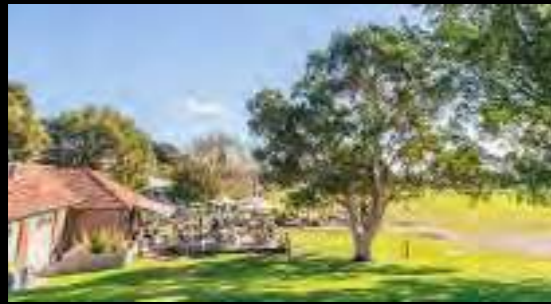
QUEENS PARK KITCHEN