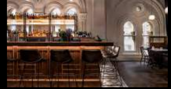
ESQ BAR + DINING