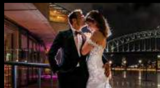
WEDDINGS, SOCIALS & CORPORATE EVENTS