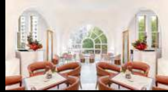
REIGN AT THE QVB