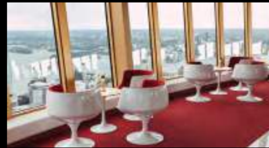
BAR 83 SYDNEY TOWER