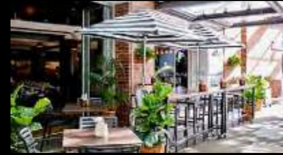
WALSH BAY KITCHEN