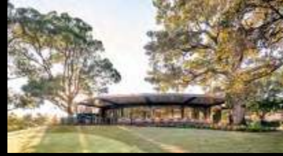
TERRACE ON THE DOMAIN