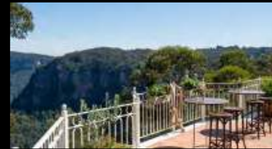
THE LOOKOUT ECHO POINT