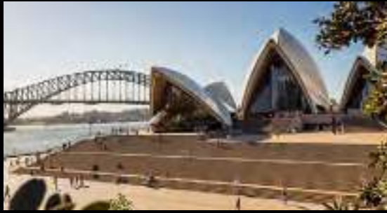
SYDNEY OPERA HOUSE