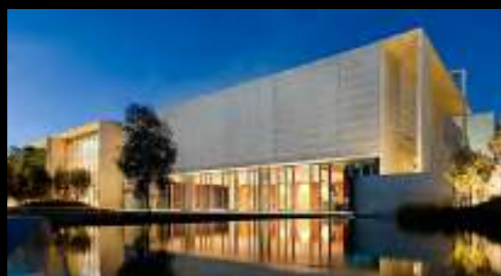
NATIONAL GALLERY OF AUSTRALIA