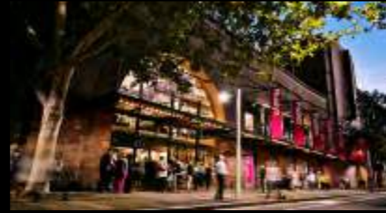
ROSLYN PACKER THEATRE