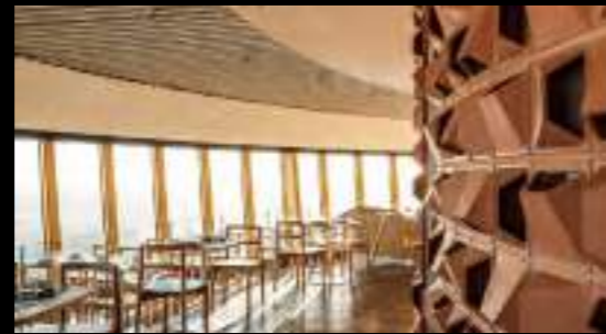
SKYFEAST SYDNEY TOWER