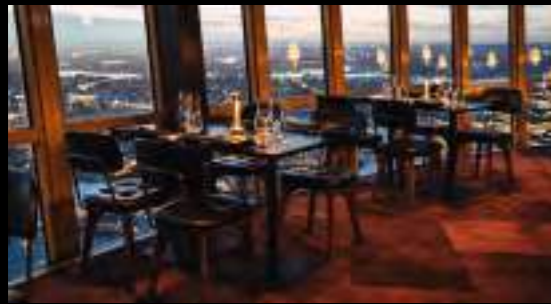
INFINITY SYDNEY TOWER