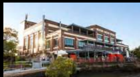
MARY MAE'S BAR & KITCHEN