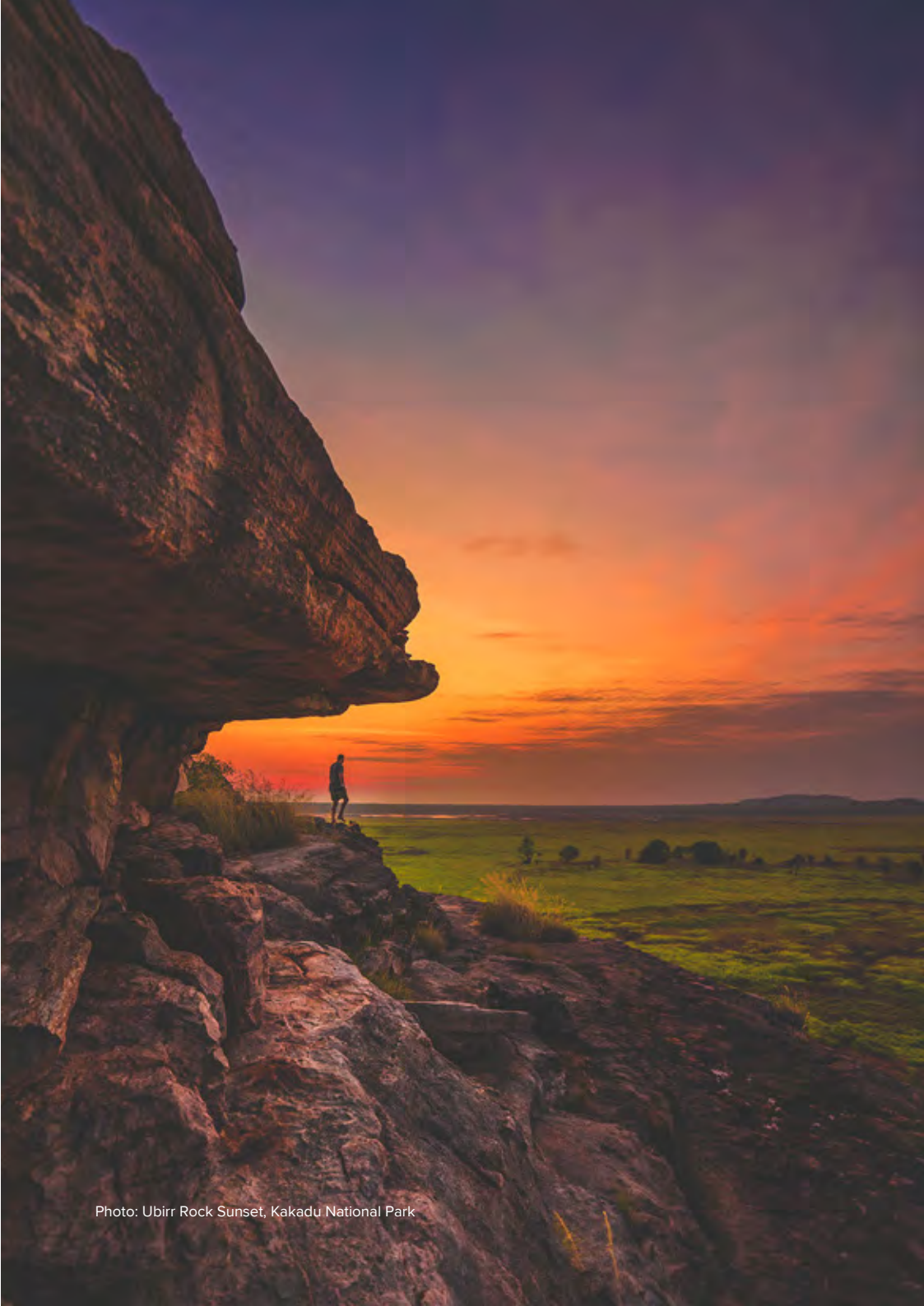
Photo: Ubirr Rock Sunset, Kakadu National Park